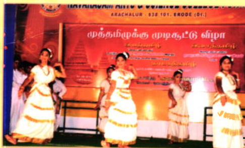
Fine Arts students staging the performance of Mohini Attam