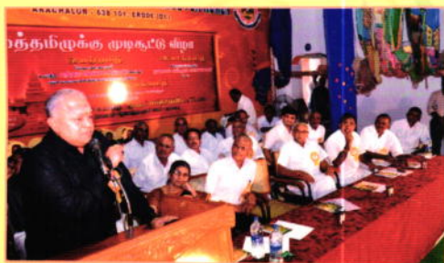
Muthamilukku mudi sootu vizha Special Address by Raadha Ravi Cine Actor Chennai