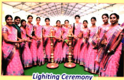
Lighting the knowledge by our students in Temple of Navarasam