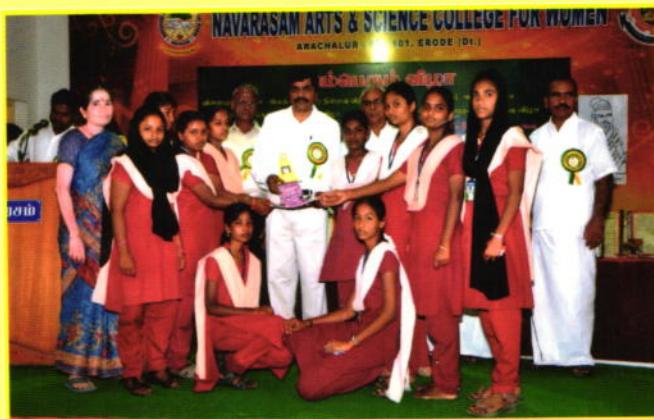
Kavizhar Kavidasan distributing prizes to school students