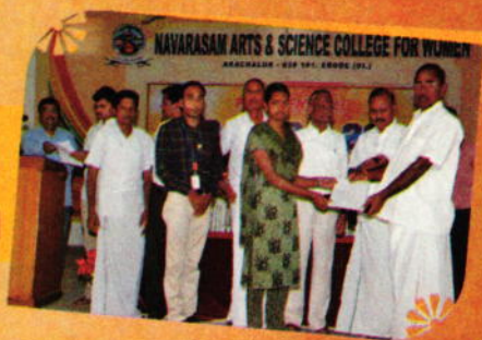
Our Student is receiving Appointment order from the reputed Company through our placement Cell