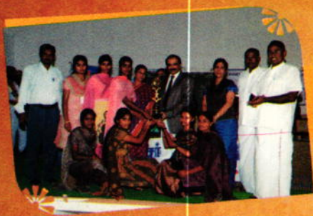
Women's Day Celebration