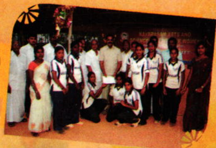
Winning moment in Ball Badminton by Our Sports Students