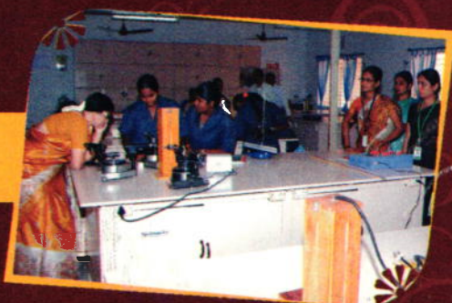
Visiting to the Physics Laboratory