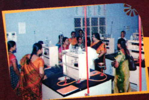
Visiting to the Bio Chemistry Laboratory