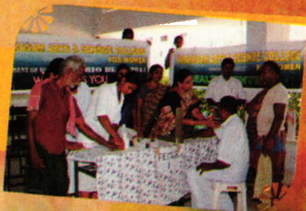
"Blood Grouping Camp" for the benefit of public by our health center