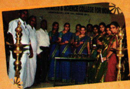
Blessing from our management in lighting ceremony