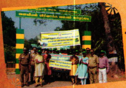
"Awareness Rally" on "Save Forest" by our students